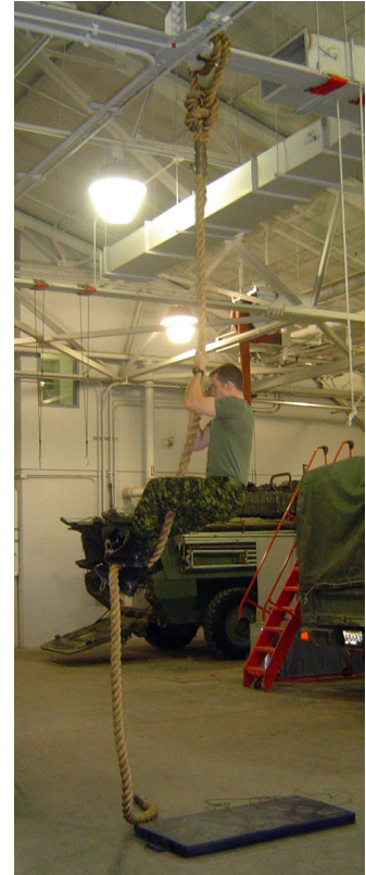
Above: The Jumping Dip Left and Below: L-Sit Variations Right: Rope Climb