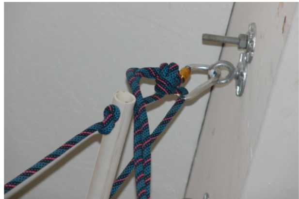
Top of ladder

The top of the ladder can be secured to an eyebolt with the carabiner "below" the top loop. A carabiner attached "above" the bottom loop will attach to another loop tied from an additional single strand of rope. This single strand passes through a locking pulley that is used to adjust tension in the ladder. We attached the locking pulley to another carabiner fed through an eyebolt attached to the bottom beam.