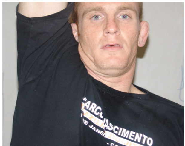
Hanging passive shoulder