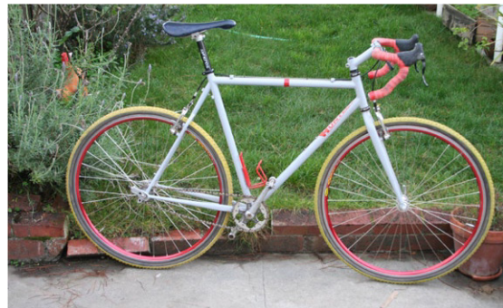
Top to bottom: Figure 5 - Chain Tensioner. Figure 5.5 - The very nice Surly chain tensioner. It has a reversible spring inside the tensioner that will allow the tensioner to push up or down. Figure 6 - Remounting a cyclocross single speed during a race. Figure 7 - Cyclocross singlespeed.