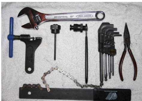
Figure 4. Tools

As you may have noticed, I didn't mention any of the physiological aspects of riding a single speed. I will leave that to the professionals. I can tell you that riding a single speed is a blast because the bikes are lighter, much quieter (no missed shifts, no chain slap, and fewer cables and housing beating the frame), and insanely simple: just pedal! Maybe it's because most of us started on single-speed bikes when we were kids (BMX, Stingray, etc.) and it's a reminder of the freedom they signified.