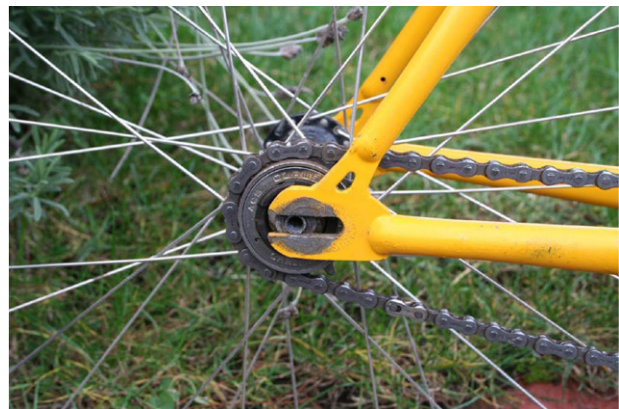
Figure Horizontal drop-out

Originally, to get a single speed, you had to take an old steel frame and weld on rear horizontal dropouts (figure 1) or buy a custom frame. Old aluminum frames can't be rewelded due to the heat treating process used to make them. The problem is that most bikes now come with vertical dropouts (figure 2) and it's impossible to get enough tension on the chain to make it operate as a single speed. Besides changing gears, the rear derailleur on geared bikes also acts as a chain tensioner. Luckily for me, I was able to purchase a used steel frame that I then took to a local frame builder and had modified for single-speed use.