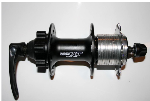
Top to bottom: Figure 5 - Straight chain line. Figure 6 - Bad chain line demonstrated on a geared bike. Figure 7 - Rear hub with spacers

Converting a bike doesn't require a huge number of tools but, unfortunately, several of the them are bike-specific. Not only that, but even bike-specific tools, such as crank arm removers, may be different from one generation to the next generation of the