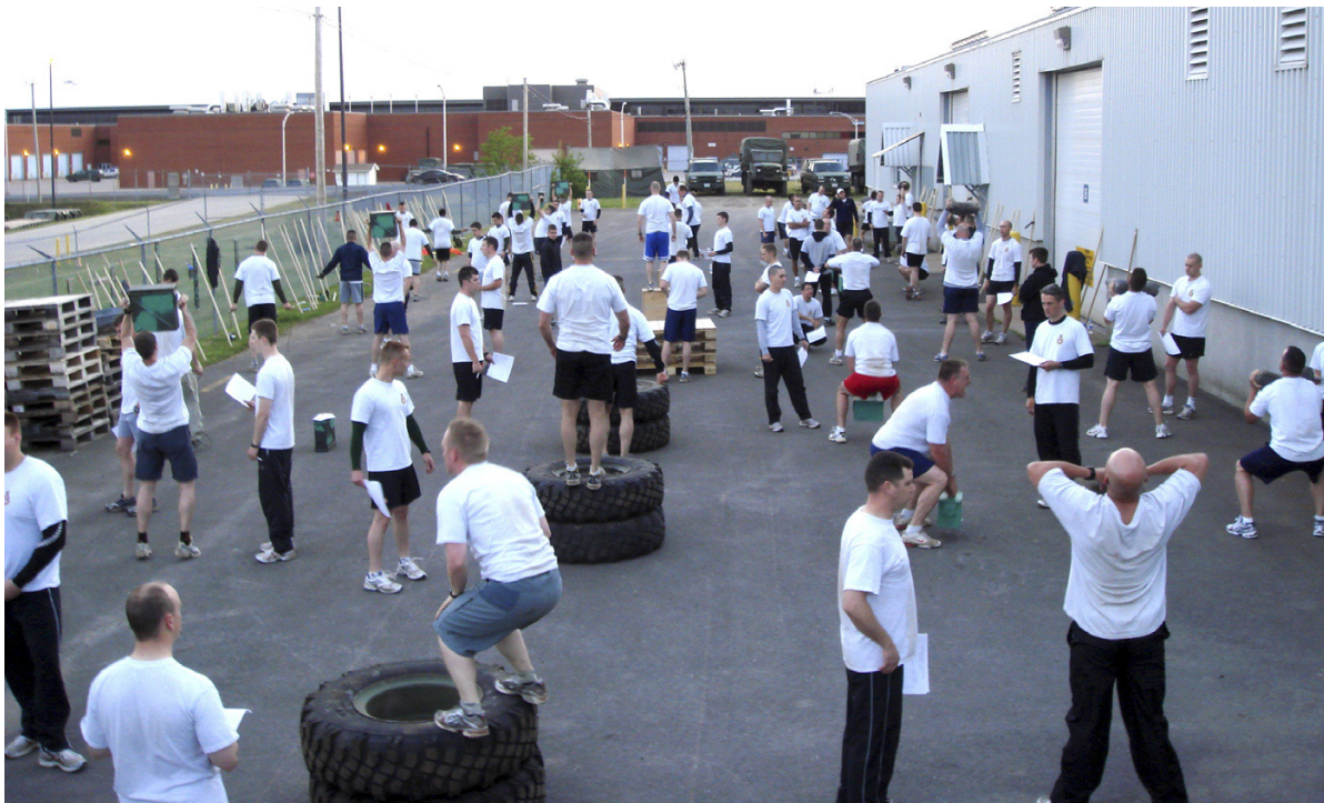
A recent 80-person implementation of "Palmer"